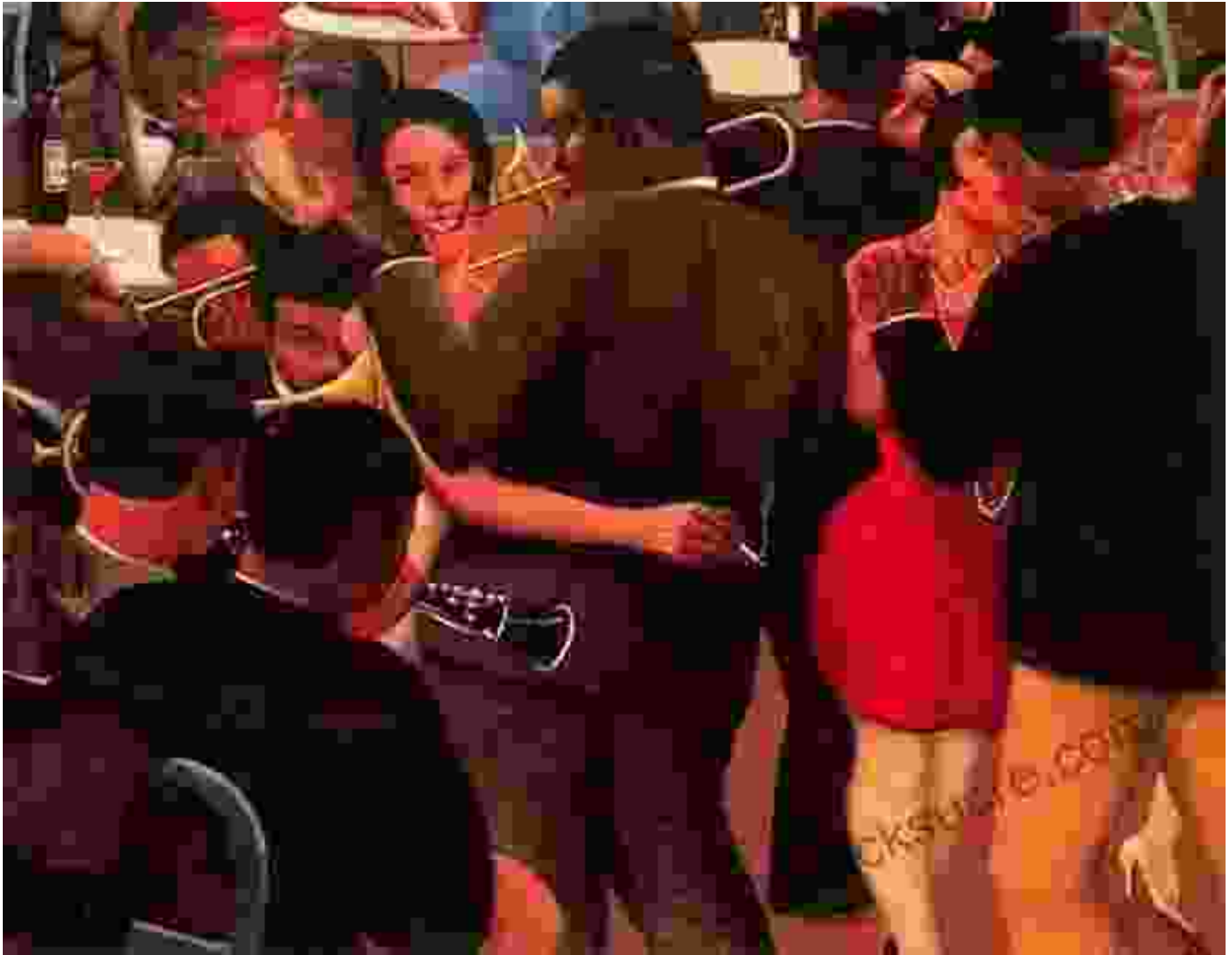
Archibald Motley Jr., "The Band," 1929, oil on canvas