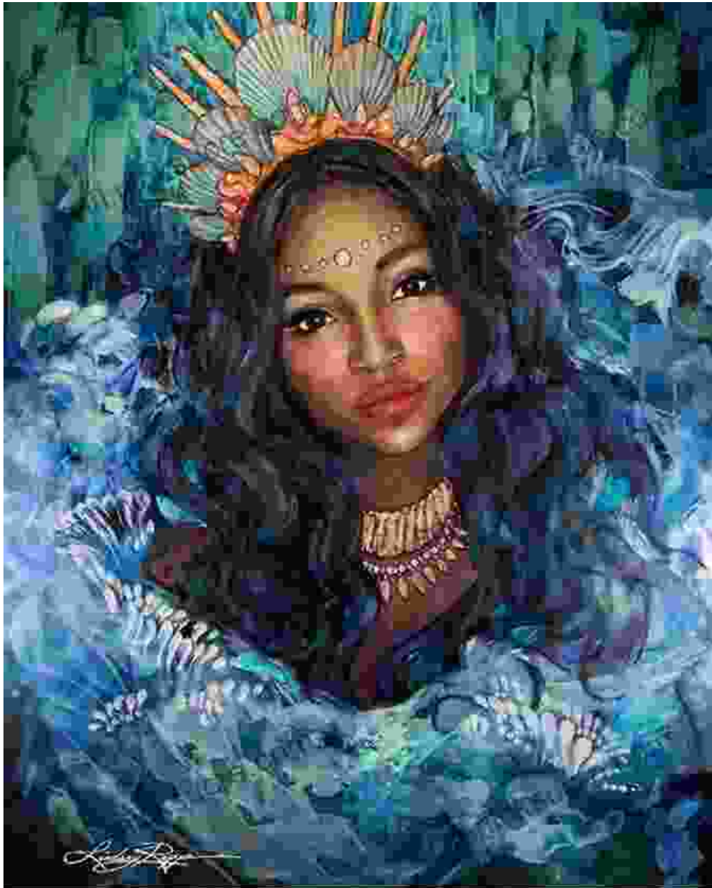
AFROSURF by Mami Wata